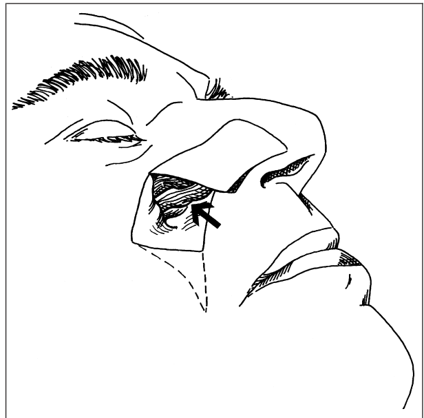
Figure 7. The arrow indicates the myocutaneous pedicle that has been raised and dissected to allow inferior rotation.

One patient with a Burget flap developed a significant complication, becoming erythematous and swollen in the first week. Oral antibiotic therapy was initiated. Superficial tip necrosis developed, and division was delayed for 6 weeks. Despite this setback, the result at 1 year was satisfactory. The complication occurred in a patient who smoked approximately 50 cigarettes a day.